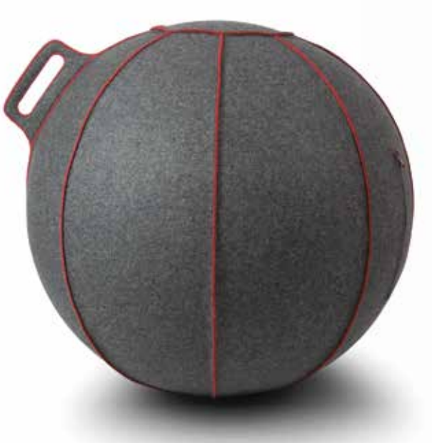
SBV-001.65/75GR GREY-FLECKED / RED

unROLL: A design-patented piping ring at the bottom prevents the ball from rolling away too easily.