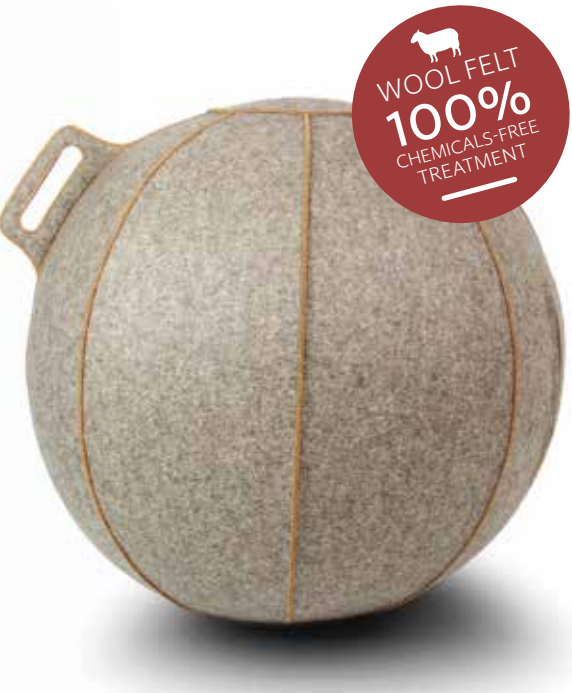
SBV-001.65/75GB GREIGE-FLECKED / BROWN