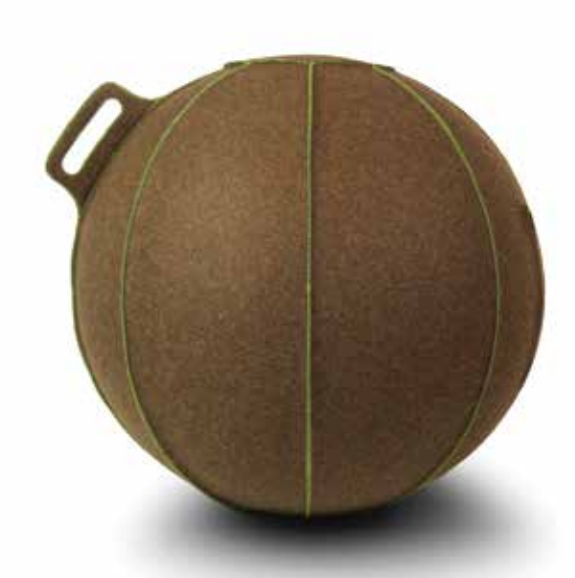
SBV-001.65/75BG BROWN-FLECKED / GREEN